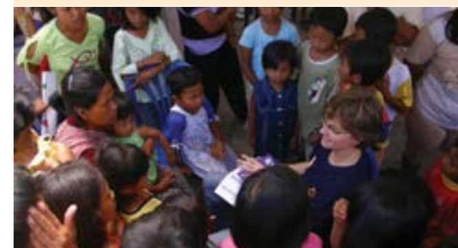
A CARE employee meets with women and children following an earthquake in Yogyakarta, Indonesia.

On May 26, 2006, a massive earthquake struck the region around Yogyakarta, Indonesia, destroying more than 350,000 homes and killing 5,780 people. Nearly three million people were affected, including 1.5 million people left homeless. Without an existing presence in Yogyakarta, CARE launched its emergency response through a local organization, Dian Desa. Responding to an emergency through a partner was a new approach for CARE Indonesia, and at the beginning, Dian Desa was treated as more of a sub-contractor than a partner. As the response progressed, discussions between the two partners resulted in closer collaboration and the joint decision-making of a true partnership. Dian Desa’s existing local knowledge and networks resulted in fast procurement and distribution of emergency supplies. The response, which reached 200,000 people, was rapid and effective. This experience led to the development of partnership guidelines outlining roles and responsibilities that would be used in future CARE responses worldwide.