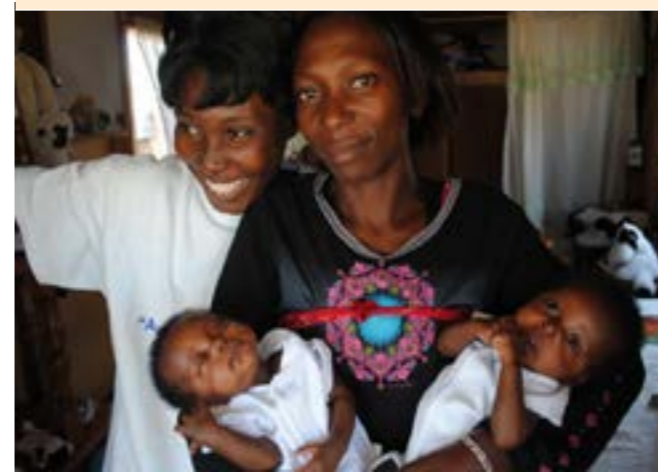
CARE worked to combat gender-based violence and reduce mortality and morbidity amongst women and girls in Haiti following the earthquake.

After the devastating earthquake that killed more than 200,000 people, CARE's emergency response not only saved lives, but also worked to combat gender-based violence and reduce mortality and morbidity amongst women and girls in Haiti. CARE trained community members, health services providers, police officers, judges and government officials to provide improved sexual and reproductive health services and to better prevent and respond to gender-based violence. CARE established fathers' clubs, youth groups and women's groups to share information about resources available. Improved use of services, particularly by pregnant women and women with newborn babies, showed that local awareness of key issues increased and that health service provision was strengthened.