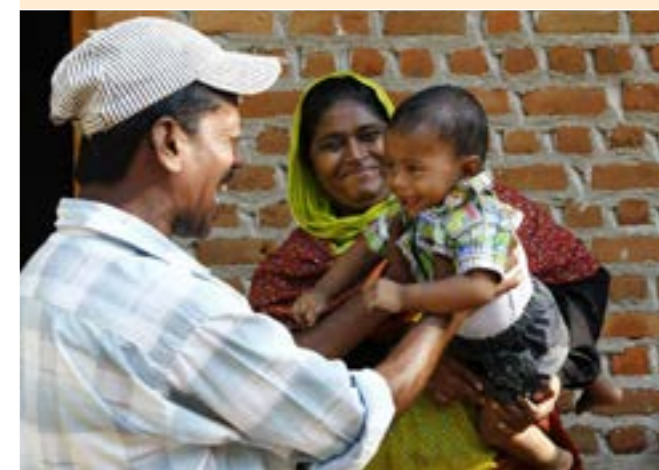
In Sri Lanka, CARE started women's and men's groups to monitor violence in their communities, refer cases, and also intervene directly to stop the violence.

In Sri Lanka, years of conflict followed by a devastating tsunami led to widespread violence against women. CARE's Prevention of Gender-based Violence project started women's and men's groups to monitor violence in their communities, refer cases, and also intervene directly to stop the violence. The project also helped government officials build capacity needed to address violence in the community. "I used to be a violent man at home, with a temper that flared over the slightest thing. I used to regularly beat my wife. Now I am a different person altogether, answerable to my own conscience. I now help my wife with the housework – washing clothes and sometimes even cooking. I help my children with their school work. I listen to my wife and we take decisions together. I no longer feel I should have more power than women." – Project participant.