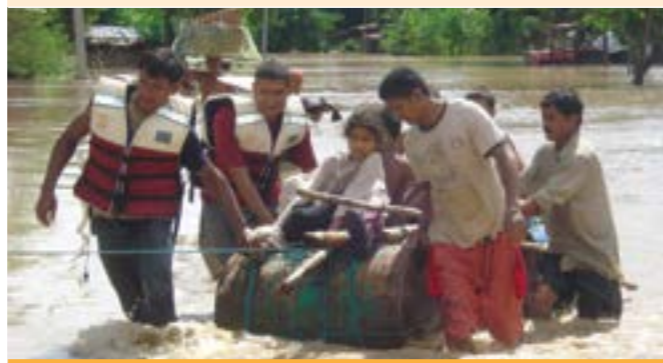
CARE staff rescuing children during flooding in Nepal.

CARE works in areas of Nepal that are badly affected by flash flooding. Here most men of working age migrate for work, leaving women to run households. Thus local disaster risk reduction committees set up by CARE are dominated by women. Through these committees women have been involved in risk assessment and mitigation activities. They have built drainage systems to keep floodwaters away from the roads that connect them to health services, schools and markets. And they have conducted awareness-raising throughout their communities so that people know how best to protect themselves in the event of severe flooding. In terms of enhancing gender equality, these women have developed new skills that they have since shared with their husbands, and they have also lobbied local government for more resources to continue their work. Through CARE's flood mitigation activities rural Nepalese women have been empowered and have made themselves and their communities less vulnerable to disaster.