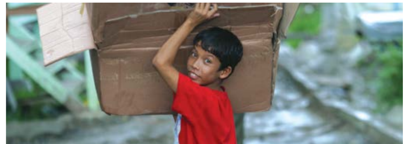
An Acehnese boy carries a box with supplies from CARE following the 2004 Indian Ocean tsunami.

Alongside this growing need, there are emerging challenges both for people affected by disasters and for the humanitarian actors, such as CARE, who respond.