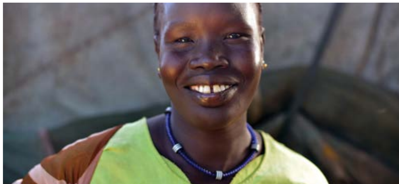
In South Sudan CARE is providing emergency sexual and reproductive health services to women and girls, ensuring that these can be accessed safely.

CARE's experience, together with that of its local implementing partners in both emergency response and development, should be multiplied through efforts to influence broader social change and through the sharing of lessons, evidence and innovation that promotes this social change on as wide a scale as possible. Also essential to CARE's strategy is the belief that no significant impact can be made if the social inequality that underlies poverty, especially the unequal status of women and girls, is not addressed.