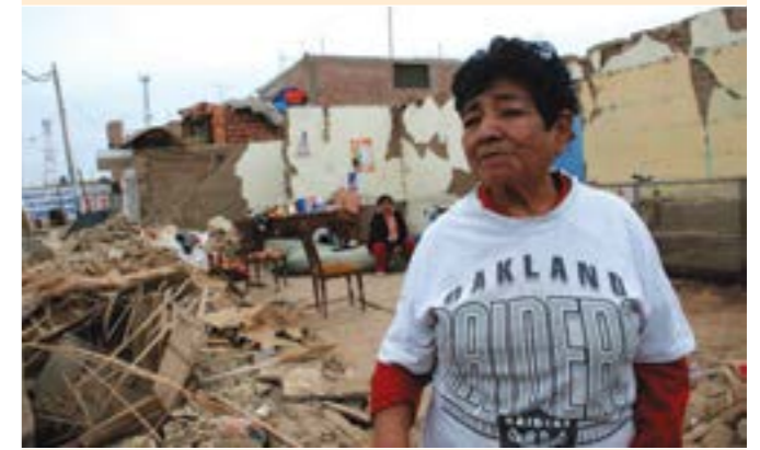
A woman stands amongst the rubble following an earthquake in southern Peru.

On August 15, 2007, an earthquake in southern Peru killed 595 people and destroyed 75,000 homes. Nearly 300,000 people were affected. While much of the wider emergency response operation focused on the city of Pisco, CARE switched its attention to marginalised communities living in rural areas. CARE established a Safe and Secure Housing Group that brought together donors, local universities with special expertise and national and international aid agencies to share knowledge on earthquake-resistant housing technologies. After three years, CARE's initiative and perseverance had led to the reconstruction of 4,600 safe and healthy permanent houses as well as a considerable increase in related knowledge and skills amongst local people. Thanks to this emergency response and the multi-party housing group that it created, there now exists a simple, practical and locally relevant design for earthquake-resistant housing that has been used ever since across rural Peru and is even incorporated into Peruvian housing law.