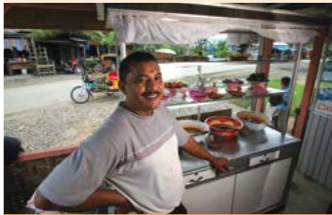
CARE helped businesses in Aceh get back on their feet after the Indian Ocean tsunami.

As part of its recovery work after the Indian Ocean tsunami, CARE supplied food through local shops in areas where local markets were functioning. This was a relatively new method at the time, yet it had been proven that a market-based approach can contribute to the recovery of local businesses and economies. Rather than distribute a standard food package, CARE provided survivors with vouchers for basic food items that could be exchanged for food at pre-approved local shops. In this way, CARE not only helped local businesses to get back on their feet but also helped recipients of the vouchers make choices in leading their own recovery and meeting their needs. This approach has been replicated in emergency responses around the world, and is now recognized as an effective solution to meeting people's needs for food and basic supplies in communities where markets are functioning.