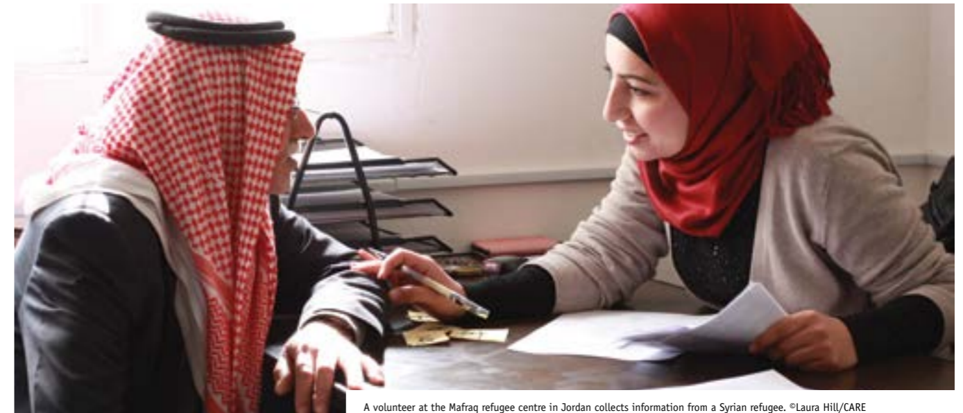
A volunteer at the Mafraq refugee centre in Jordan collects information from a Syrian refugee.

In the Indian Ocean tsunami response, the humanitarian community had to deliver huge volumes of aid to hundreds of thousands of people affected in a very compressed timeframe. This "tyranny of the urgent" affected how well survivors' needs were understood and the quality of response plans. Although vast numbers of people were reached in record time, there were gaps and duplications and, most seriously, some of the most vulnerable people were missed. Multiple evaluations pointed to a lack of timely, in-depth analysis that incorporated the views of people affected and also to the lack of coordination between humanitarian actors in needs assessment processes 17 . It was agreed then that future needs assessments be standardized and findings shared to contribute to emergency response plans built on more rigorous evidence of need.