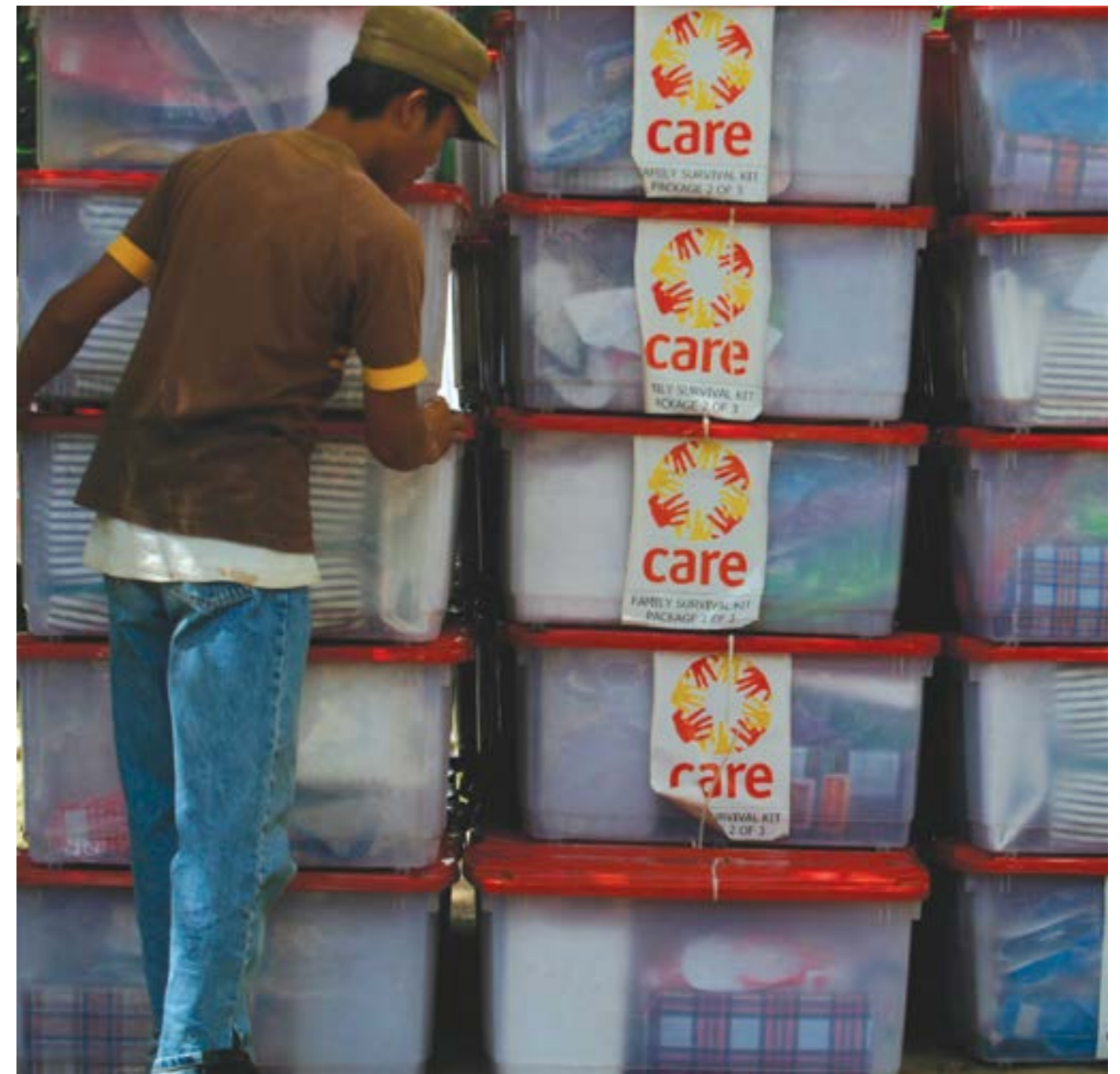
An aid worker prepares CARE relief kits following the 2004 Indian Ocean tsunami.

The complexities of the crisis and the global public scrutiny that followed laid the foundation for a new era in emergency response.