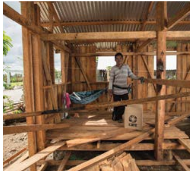
CARE helped families rebuild their homes following Typhoon Haiyan in the Philippines.

As an experienced, professional organization that has been involved with the response to major crises and disasters for 70 years, CARE will contribute its own lessons, expertise and perspectives on enhancing emergency response effectiveness, particularly where the needs and rights of women and girls are concerned. CARE will also advocate for a more holistic approach to emergency response in the future. CARE's goal is to help build an inclusive humanitarian community of new and existing partners that not only saves lives, but also builds resilience and addresses more effectively people's underlying vulnerabilities, enabling them to be more able to cope with and recover from future disasters.