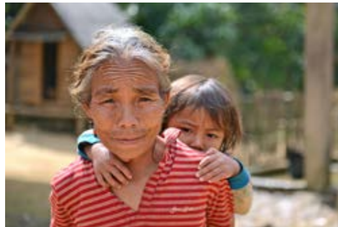
A woman in Phongsaly Province, northern Laos, where CARE is working with remote ethnic communities to create opportunities to earn money and improve their health.