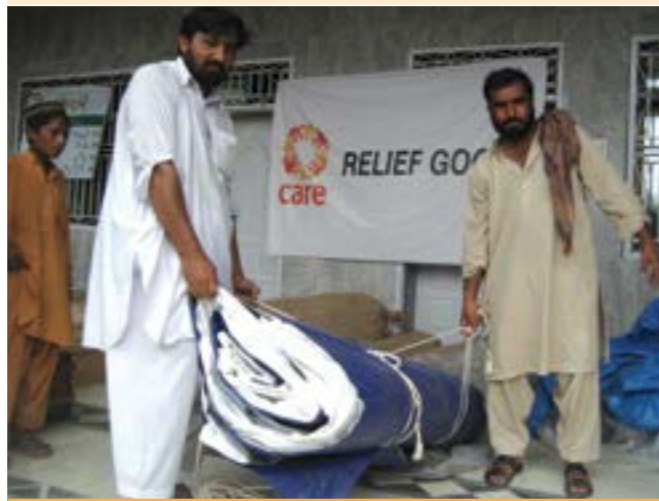
Distribution of relief goods during the 2010 Pakistan floods.

Following a series of disasters in Pakistan, including the massive floods in 2010, CARE worked to strengthen emergency preparedness in the communities where it works by supporting stronger national coordination and collaboration between the local, provincial and national governments, international and national civil society groups, and communities between and during crises. This work was made possible thanks to flexible donor funding, which affords a dedicated preparedness team and a pool of available funding in country. CARE also invested in the preparedness capacity of its local partners, which are critical for response. As a result, CARE, its partners, and local communities are now better prepared to respond in the hours after any new humanitarian crisis. Emergency response is a continuum: helping people prepare for and mitigate the impact of disasters, providing life-saving assistance during a crisis, and working with communities to recover afterwards.