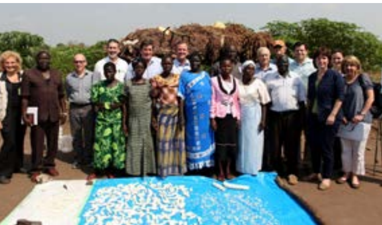
The delegation spends time with a group of women farmers in Yei County, South Sudan. They listened to the challenges and successes the female farmers have recently faced.