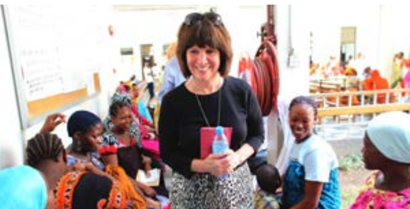
Rep. Betty McCollum, D-Minn., walks through Buguruni Health Center in Dar Es Salaam, Tanzania. The health clinic offers comprehensive reproductive maternal new born and child health and HIV/AIDS outpatient services to over 80,000 residents.

The hospital is significant in that it provides a comprehensive package of services under one roof, which helps ensure that mothers get the type of care they need. The program also recently introduced a service that distributes check up reminders and safe pregnancy tips through text messages. As the delegation walked through the hospital, each delegate received a sample cell phone in order to experience the text messaging service. They met several young mothers who told their personal stories of how the hospital has enabled them and their children to live healthier lives.