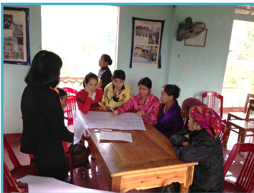
Picture 3: Female FGD in Mo O commune, Dakrong District, Quang Tri Province

Female people have good knowledge on DRR in Bac Kan