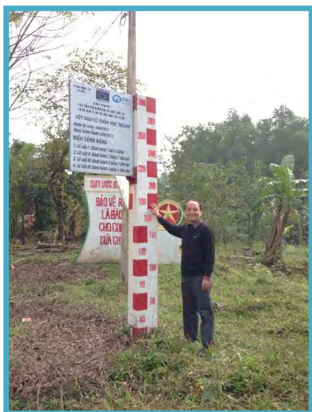
Picture 4: Flood-warning pole in Mo O commune, Dakrong District, Quang Tri Province