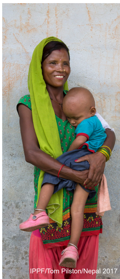
IPPF/Tom Pilston/Nepal 2017

Investing in reproductive health care has also been calculated to bring substantial savings in public spending. A large body of work has calculated that for every dollar invested in family planning, the community could save between $4 and $31 in other areas like education, public health, and water and sanitation. 22 Investing in family planning and girls' education are also ranked among the most effective solutions to reducing global greenhouse gas emissions and mitigating environmental degradation. 23